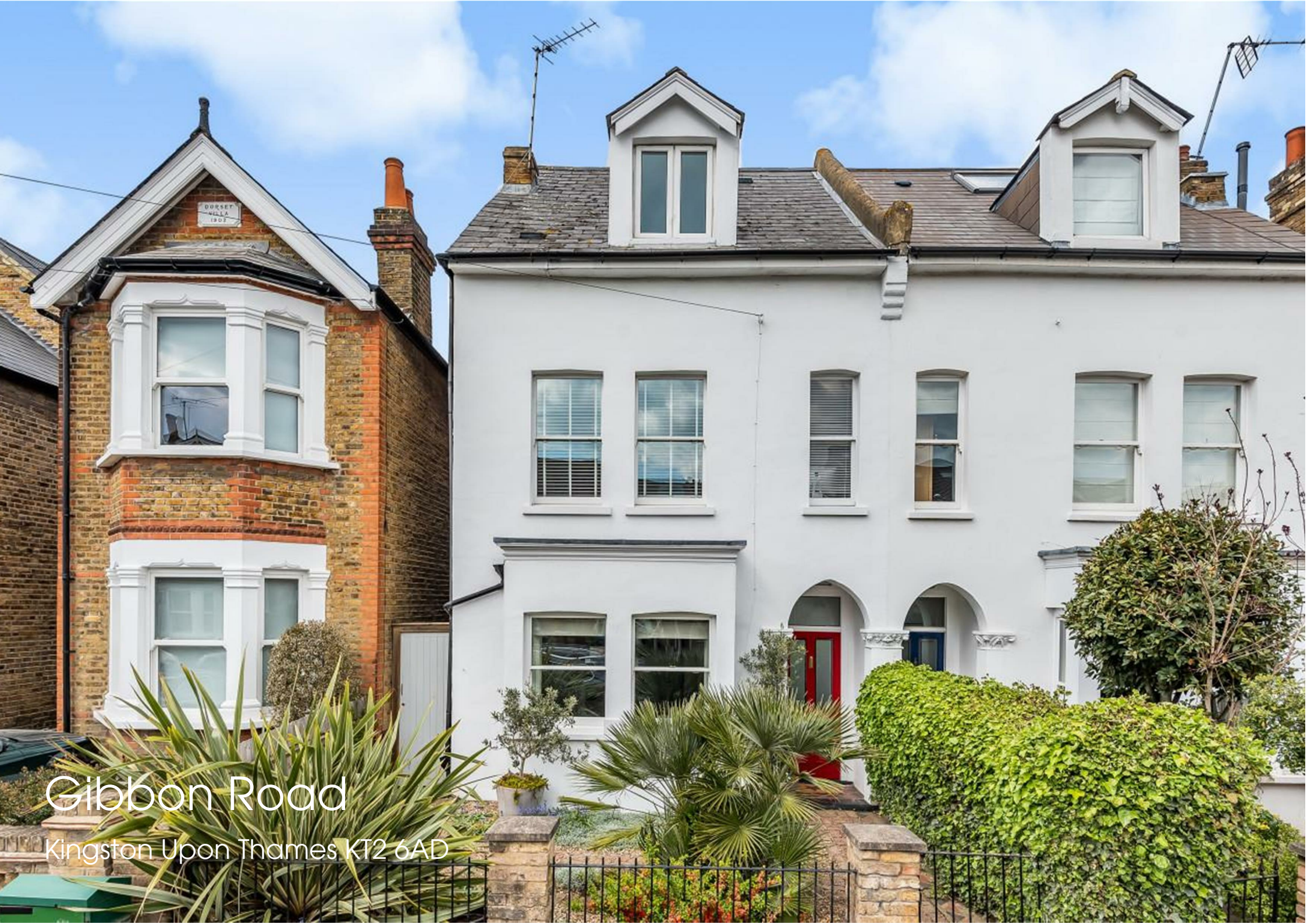
Gibbon Road Kingston upon Thames KT2 6AD

34 Richmond Road Kingston upon Thames Surrey KT2 6ED www.gibsonlane.co.uk Tel: 020 8546 5444